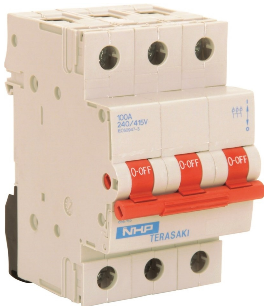
MOD6 main switch, DIN rail, 3P, 100A

Representative Photo Only (actual product may vary based on configuration selections)