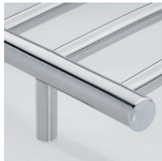
Example of finish

Typically a concealed cord entry is used for a new home or new bathroom installation where no existing outlet is present