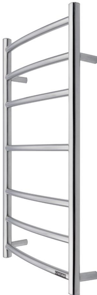
Contemporary Ladder Series