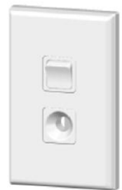
SWITCHED PERMANENT CONNECTION OUTLET