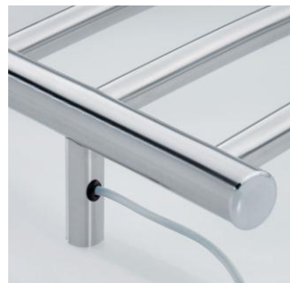
Example of finish