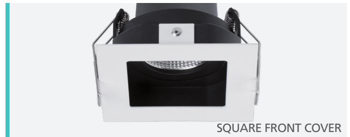
SQUARE FRONT COVER